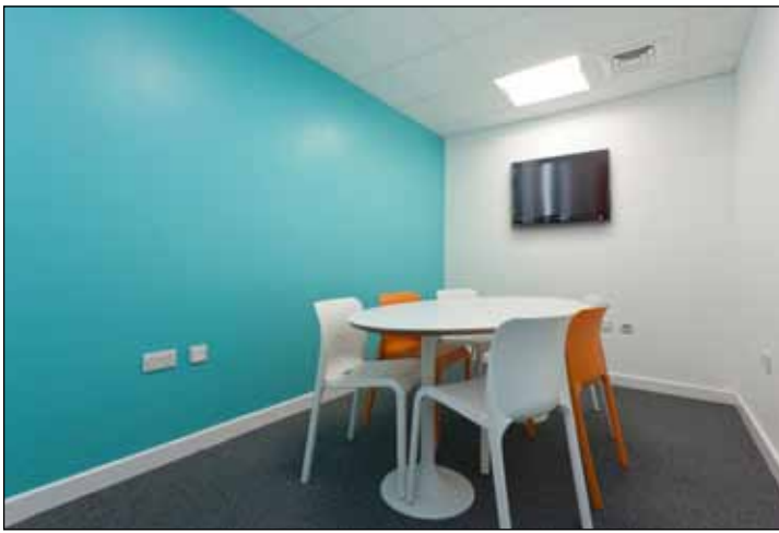
Shared Work Room